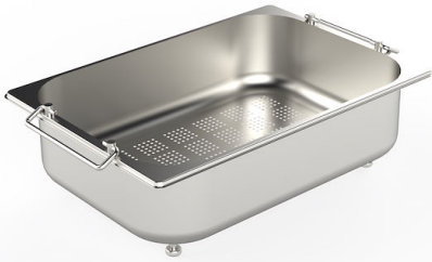
CUVETTE PERFOREE INOX A154 F00

* only in combination with the accessory A644 F04