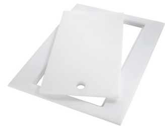
PLANCHE DE DECOUPE DOUBLE HDPE