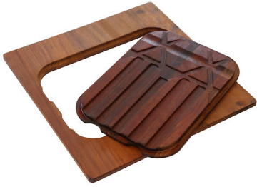
PLANCHE DE DECOUPE DOUBLE IROKO A644 F04