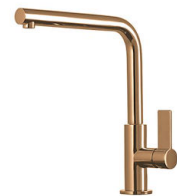
VERONA COPPER R497 D06