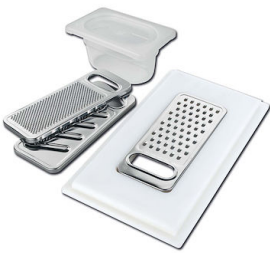
KIT RÂPES ET PLANCHE DE DECOUPE HDPE