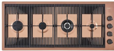
MILANO 4 BRULEURS COPPER G681 F08