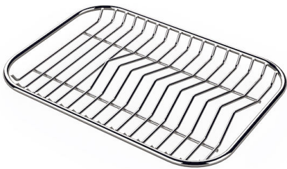
GRILLE PORTE-ASSIETTES INOX 25x35

* only in combination with the accessory A644 A01