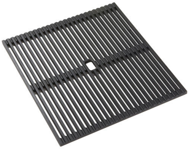
GRILLE NOIRE POUR EVIERS RIVA A100 E02