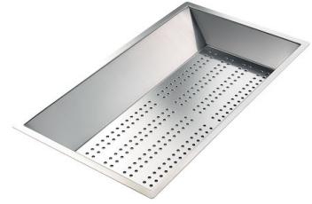
CUVETTE INOX PERFOREE A151 F00 * only in combination with the accessory A644 A01