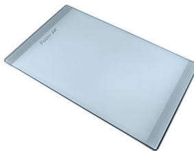
PLANCHE DE DECOUPE CRYSTAL 23x41 CM

* only in combination with the accessory A644 F04